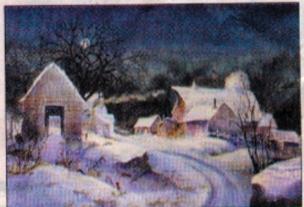
A painting by Jim Mondloch.